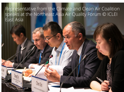
Representative from the Climate and Clean Air Coalition speaks at the Northeast Asia Air Quality Forum

June 1-2, Seoul Metropolitan Government and ICLEI East Asia co-organized the 7th Northeast Asia Forum on Air Quality Improvement, attended by representatives from 13 Northeast Asian local governments. The Forum addressed the complexity of air pollution, the relationships between economic growth and air quality, and the need for further cooperation on air quality improvement via knowledge sharing in the region.